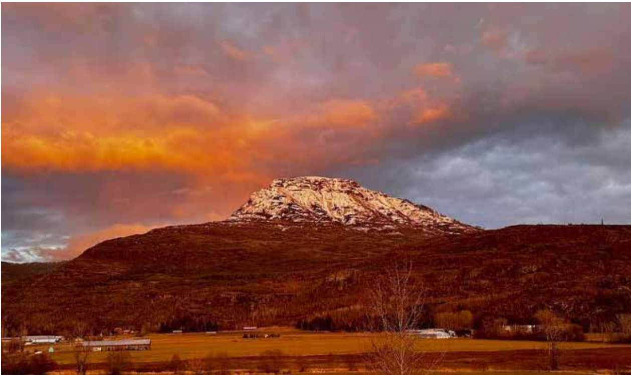
> Mt. Ida sky captured in all its stunning glory from the valley