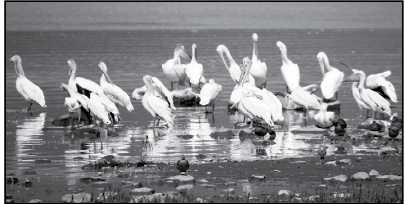
> A pod of American white pelicans hang out east of Christmas Island. Photo by Joan Chadwick. See her Facebook page to purchase cards available of foreshore pelicans.