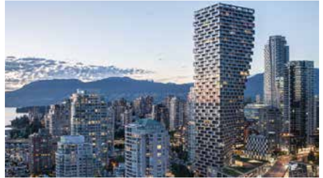
> Vancouver: gravity defying mountain blockers among nearly 700 highrises in metro Vancouver

> Since I left my home city of Winnipeg 40 years ago, only one tower was built that exceeded the tallest tower since 1979. It was completed two years ago. The six towers that do congregate around Portage & Main generate wind tunnels. I appreciate dramatic skylines, but there's something to be said about the liveability and human scale of lower rise cityscapes.