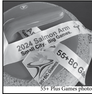
55+ Plus Games photo

> Silverback season starts today, Sept. 20 in Alberni. Away games in Sherwood Park, Sept. 27 and Spruce Grove, Sept. 28 in Edmonton area. First home game, 7 pm, Oct. 7 vs. Vernon. > Gravel Ride at Larch Hills , Oct. 6. 10 & 20 km rides, plus 40 km. timed ride & 5 km walk option. See ridedonthide.com > Learn Curling Clinics , Sept. 22, 23, curling rink. > Fall Fun Guides - in print or at salmonarmrecreation.ca > Lawn Bowl , 1:30, Mon, Fri. > Horseshoes , 6 pm, Tues/Thur