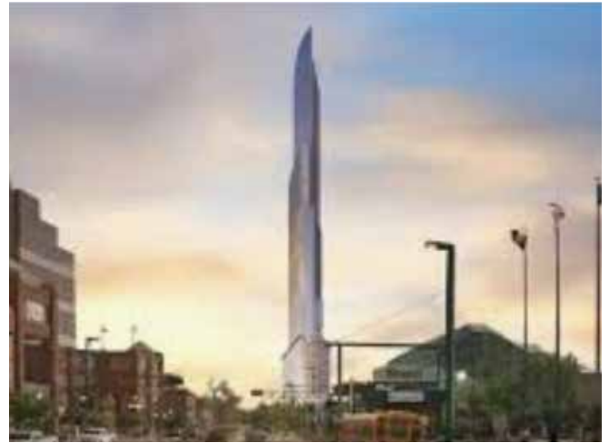
> Edmonton: proposed 80-storey Aldritt tower to become Western Canada's tallest. Why?