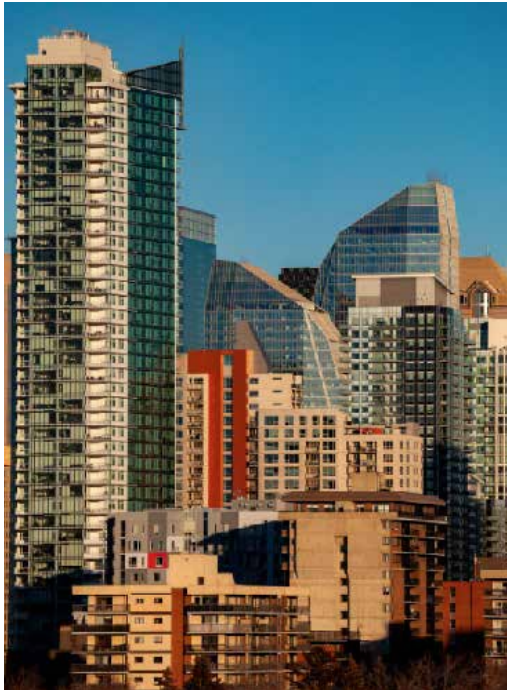
> Calgary: compact clutter