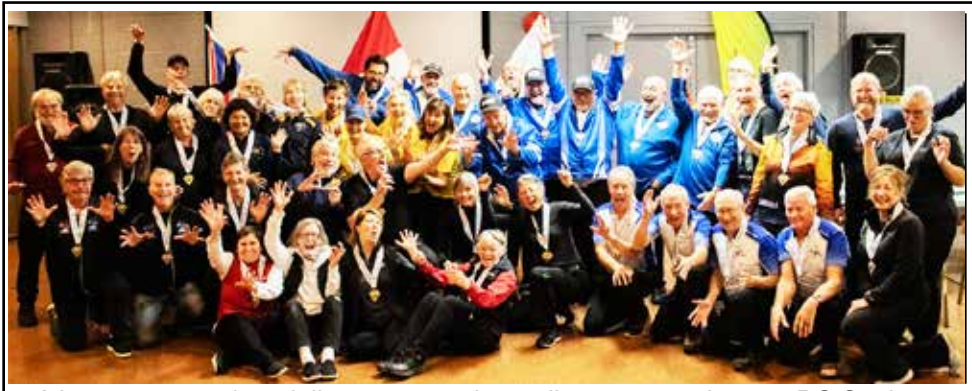
> A happy group of medalists wrap up the curling event at the 55+ BC Senior Games. All reports say a job well done by Salmon Arm and Shuswap hosts. More on the games pages 5, 7 and FriAM.ca bonus pages.

What an inspiration for all of us as we age. ■